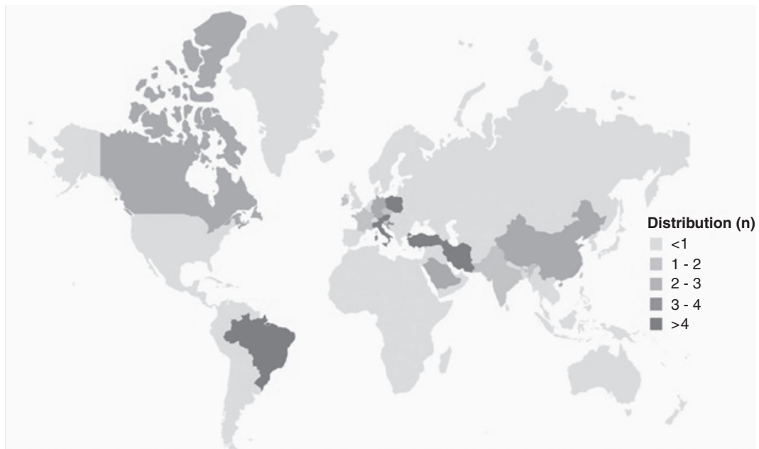
Figure 2. Distribution of included articles according to the geographical areas.