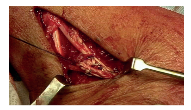
Figure 2. Tenodesis of the index finger EDC on the middle finger EDC followed by reinforcing Vycril 3/0 stitches on the middle finger EDC partial lesion. A Pulvertaft technique was used to suture the EDM tendon on the distal stump of the EIP.

Post-operative indications included cast immobilization for 6 weeks, prolonged for more two weeks at night and during manual work. The patient was allowed to start active mobilization of the index and middle finger at two weeks while maintaining the cast. At 4 weeks, active assisted physical therapy of the fingers and wrist were allowed while temporarily removing the cast. At 6 weeks, light activities of daily living and unlimited mobilizations were allowed. At 2 months follow-up the patient presented full active and passive ROM with full extension strength recovery and no pain (Fig. 3). No complications were noted. The patient was able to resume her work as a nurse at 4 months follow-up.