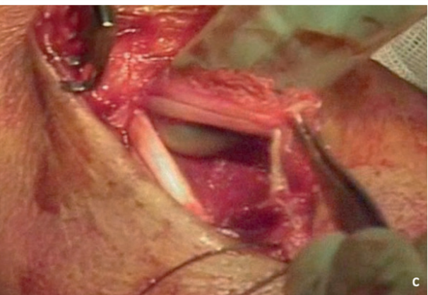
Figure 1. a) Dorsal longitudinal incision centered on the fourth extensor tendon compartment. b) Lesions of the index finger extensor digitorum communis (EDC) and extensor indicis proprius (EIP) tendons. c) The lesion at the radial side of middle finger EDC.

on the middle finger EDC partial lesion. Direct repair of the EIP tendon was not possible. Thus, a tendon transfer of the EDM was chosen. A second 2 cm skin incision was performed at the metacarpophalangeal joint of the little finger. The EDM tendon was identified, dissected and transferred proximally through the first incision. A Pulvertaft technique was used to suture the EDM tendon on the distal stump of the EIP (Fig.2). At the end of the procedure, the patient was asked to actively move the index finger in flexion and in extension to assure correct tension and mechanical stability of the repair. After irrigation with saline solution, the wounds were closed in layers and the right hand immobilized in a palmar cast with wrist extended at 60 degrees and long fingers in intrinsic plus position.