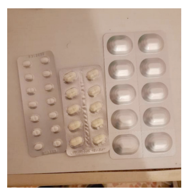
Figure 7. Pharmacological therapies to avoid relapses