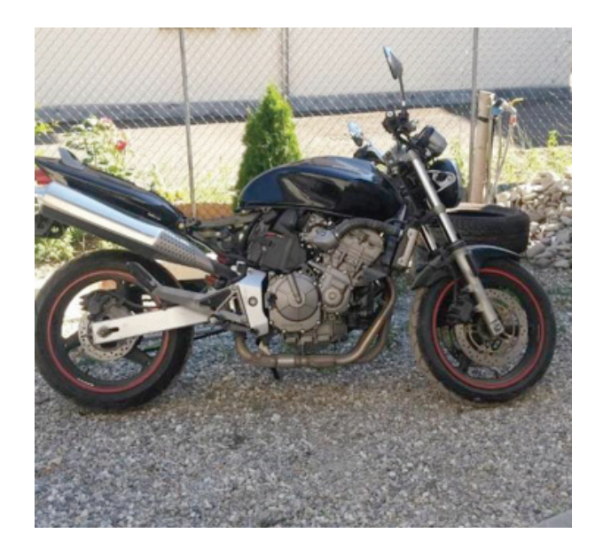
Figure 1. Personal pleasure

As for the "fun" area, the interpretation of users interviewed highlighted a perception of fun as an area of "openness" to oneself and to others. Three