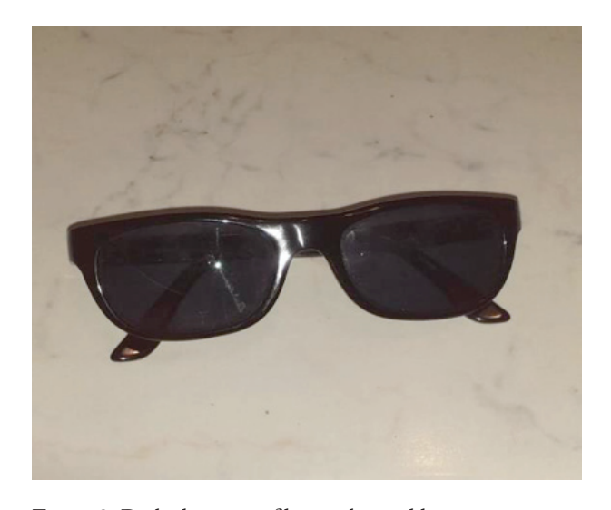
Figure 9. Dark glasses as a filter to the world

Showing the photo to the reference operator, we received a reaction of satisfaction: "I am pleased, I am pleased that he recovers the drugs ...", he says, in fact, that the patient has previously been discontinuous in taking pharmacological therapies: "... so much so that he always suspended them...". Also in the initial presentation the operator describes the difficulties: "there was a bit to be fought with regard to pharmacological