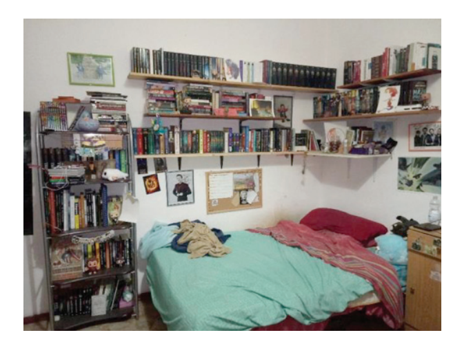
Figure 10. A safe place

The selected photo, belonging to user 3 (U3), depicts the corner of a one-bedroom room where the bed and shelves above it are clearly visible full of books and personal objects.