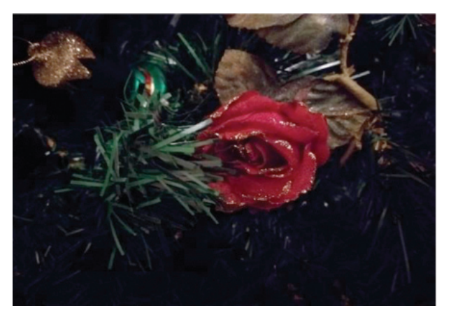
Figure 2. Fun with the family

When the photograph of the Christmas decoration was shown, the user said: "It's a day of celebration and when I'm in a good mood I can feel that life is a precious gift." And then "Now that Christmas ... a sense of family that, I don't have a sense of family in