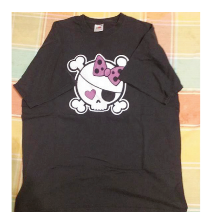
Figure 5. Take time for yourself!

In this image the user affirmed "... it's a symbolic photo" (Figure 6). When the interviewer asks why she put it in the "perception of time" area, she explains that the biggest gift a person can give is time. Then through the symbol of the gift comes to a transmitted