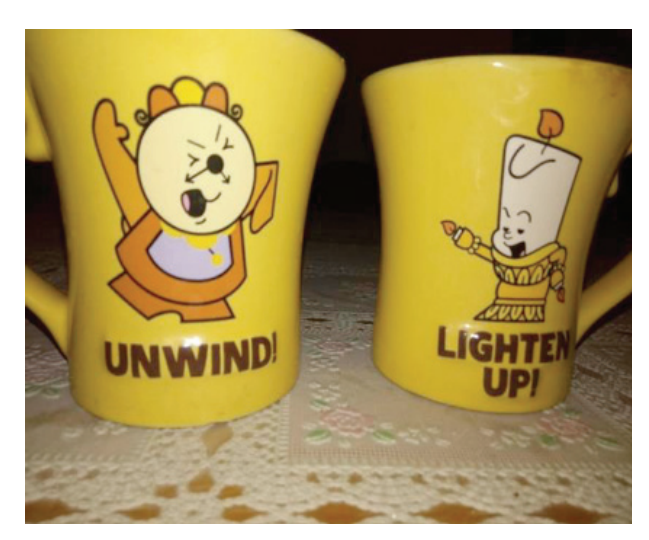
Figure 8. Family bond

Showing the photo to the reference operator, we received a reaction of satisfaction: "I am pleased, I am pleased that he recovers the drugs ...", he says, in fact, that the patient has previously been discontinuous in taking pharmacological therapies: "... so much so that he always suspended them...". Also in the initial presentation the operator describes the difficulties: "there was a bit to be fought with regard to pharmacological