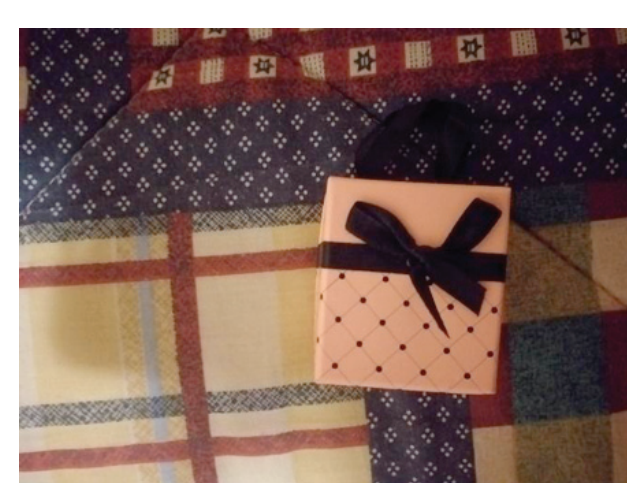
Figure 6. Time as a gift

Also in his initial presentation he had talked about relapses and therapies: "... I tried several drugs but they weren't good..." and speaks of extreme gestures: "... several suicide attempts..." and cares through drugs and interviews with therapist "... a therapist... is giving me a big help...". His concept of well-being is represented by a pharmacological and relational aspect.