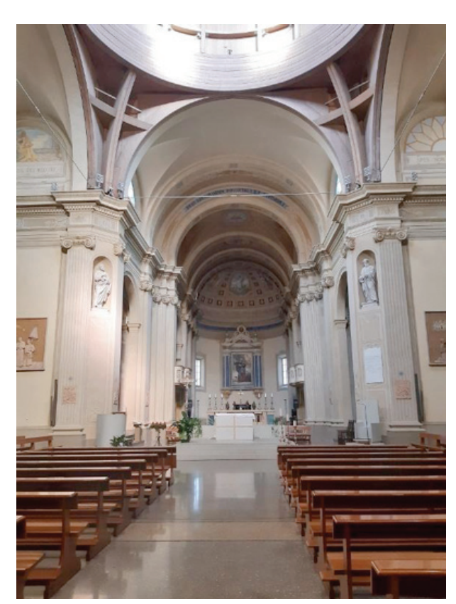
Figure 11. A place that evokes serenity

Analysing the various photographs taken by users for the area "a place where I am well" it emerged that the bedroom (or only the bed) is a recurring subject in all five cases analysed and interviewed; on the part of all five users emerged the need to photograph a comfortable and safe corner of their home, for all