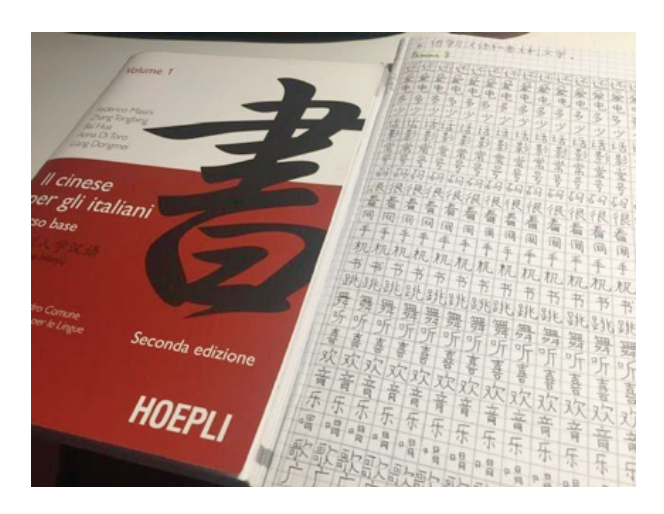
Figure 3. Fun as an openness to others

my home, but I would like it very much". With this photograph, a symbol of Christmas, the user tries to remember the funny moments spent together with his family, moments that are not always easy to find but that represent an important memory. However, when the same photograph was shown to the operator, she felt a sense of disorientation as she reports that conflicts between members appear during family celebrations: "mmm ... [short pause] Yes, this also leaves me a bit ... because ... mmm ... that is, I know that Christmas is lived in the family ... that is, let's say that being the family party sometimes conflict emerge..".