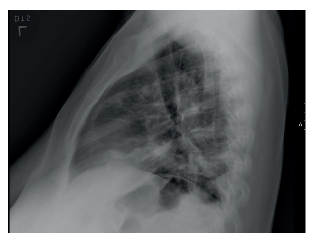
Figure 1. Chest ray in PA (a) and LL (b) projections, performed on 04/01/2020 showed bilateral patchy infiltrates.