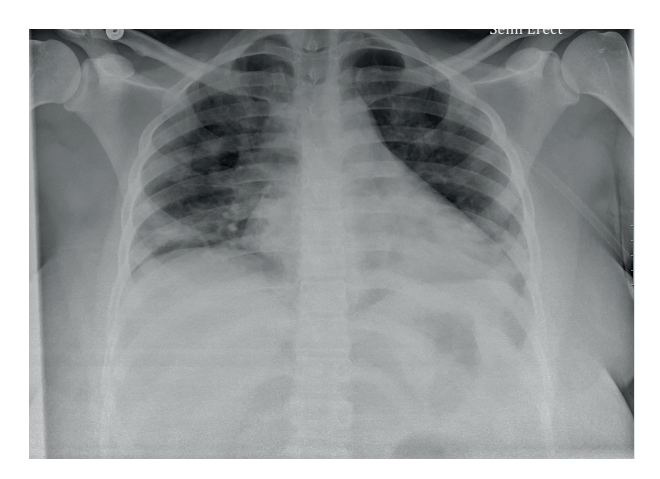
Figure 2. Chest ray in PA, performed on 04/04/2020 showed persistent bilateral patchy infiltrates.

found during liver ultrasound examination. Daily fetal testing was negative, the patient did not exhibit any obstetrical complaint. On 4/05/2020 the EKG showed a prolonged QTc (479 ms), resolved with one dose of magnesium IV (1 gr/100 ml NS), with no chest symptoms.